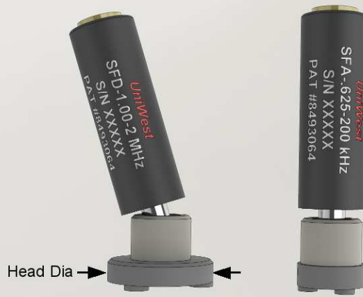
Head Dia → ←